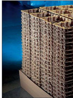
Nesting maximizes floor space efficiency

Fibreform produces high quality molded pulp protective packaging products. Save valuable time and energy by using our one-stop pulp molding resource.