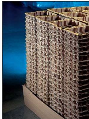
Nesting maximizes floor space efficiency

Fibreform produces high quality molded pulp protective packaging products. Save valuable time and energy by using our one-stop pulp molding resource.