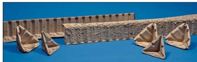
Combine High Performance Series corners with stock angle pads and pyramidal corners.